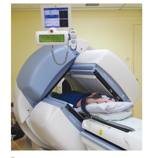
Isotope-detecting gamma cameras and SPECT/CT scanners are used by Nuclear Medicine Physicians to locate the sentinel node.

Most patients, however, will have a normal ultrasound examination and will then proceed to the operation where the sentinel node is removed so that the lymph node can be carefully examined under a microscope. If the ultrasound is normal, it does not exclude the presence of microscopic deposits of melanoma in the sentinel node.