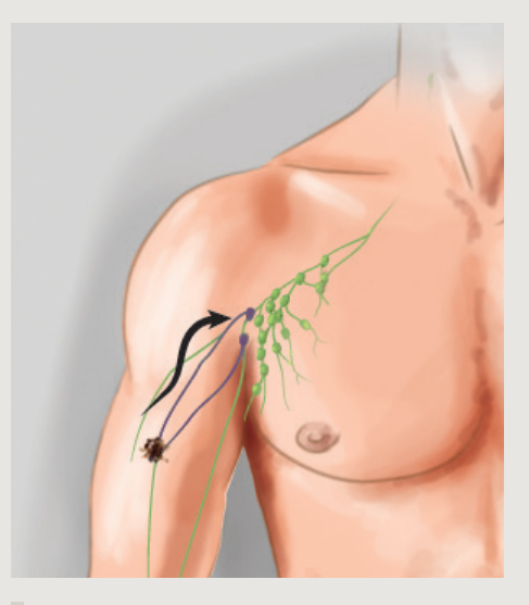
Sentinel nodes are the first lymph to which cancer cells are most likely to spread from the primary melanoma.

Nearly all parts of the body have lymphatic drainage to a specific lymph node or several lymph nodes. The pattern of lymph fluid drainage is different for each individual. The sentinel node/s are the first lymph nodes along the lymphatic vessels that drain lymph fluid from the part of the skin that has a melanoma on it.